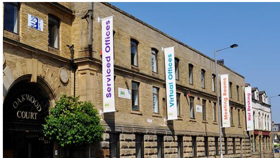
Oakwood Court Bradford