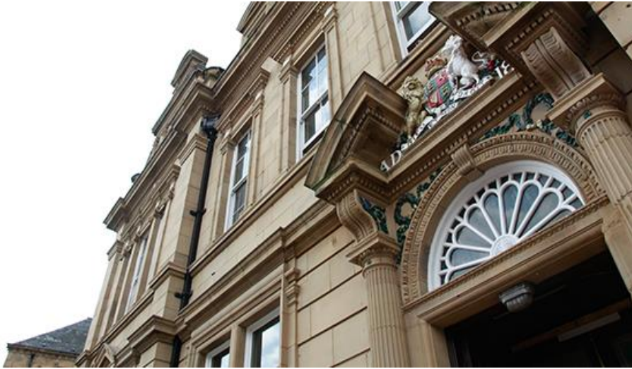
Manor Row Bradford