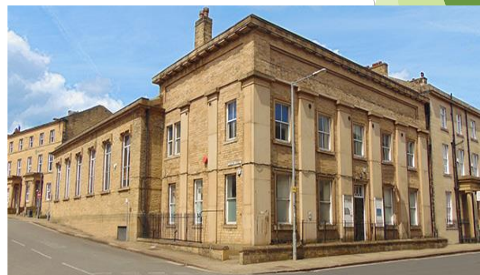
Harrison House Halifax