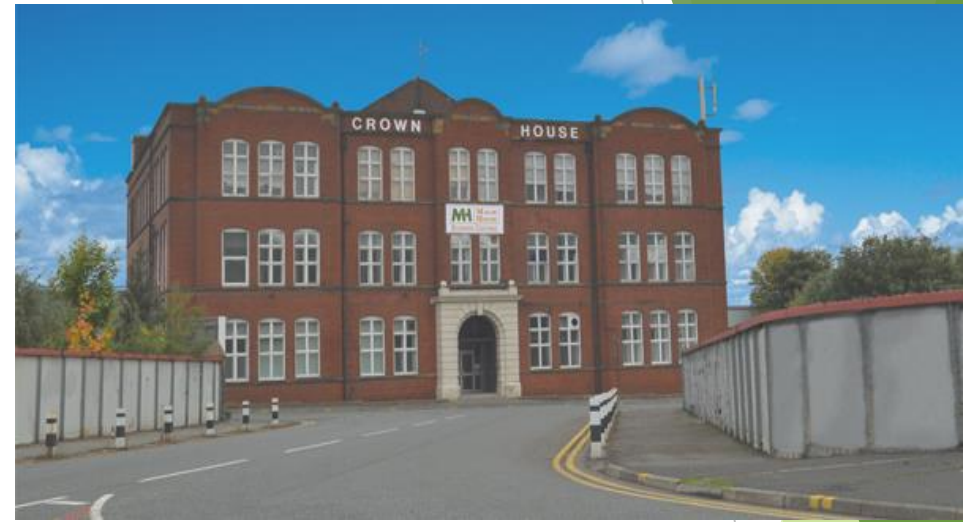
Crown House Leeds